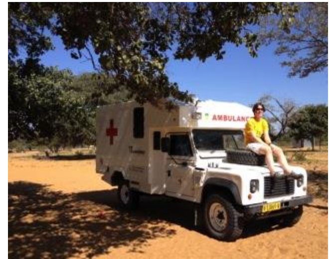
Out and about in the ambulance