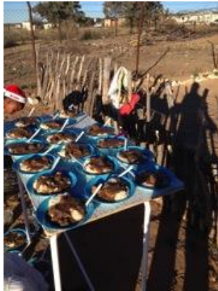
Preparing the food