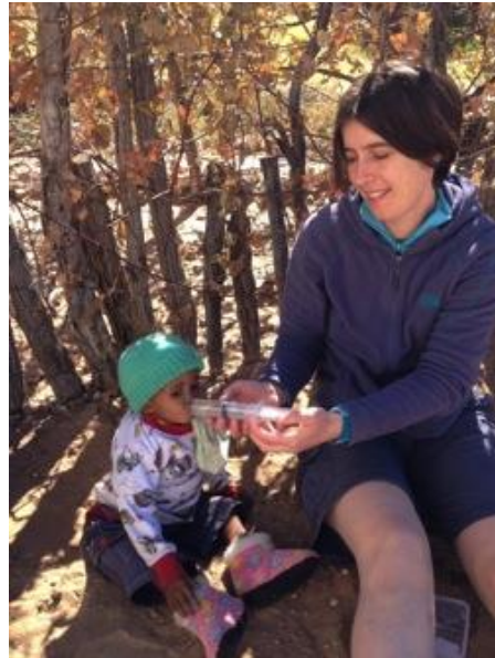
Feeding milk to a baby with severe malnutrition