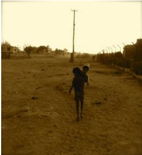
Big brother carrying little brother home