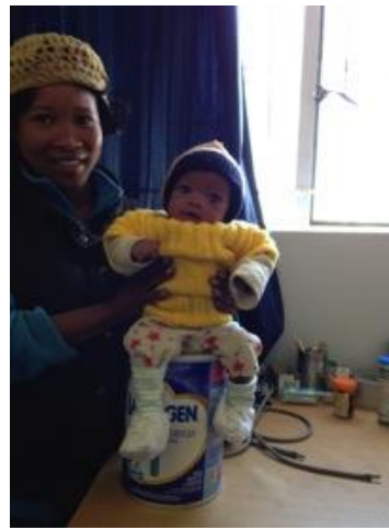
Baby milk for an orphan whose mother died from HIV