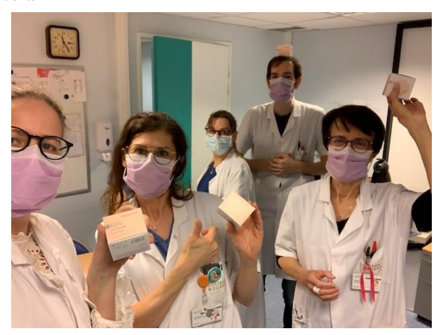
« The nursing team's thanks for the free hand and face products »

organized the distribution of 13 600 hand and face Marionnaud products to the COVID nursing people in the 5 Hospitals where we usually give beauty cares to the highest number of patients.