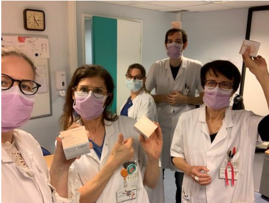
« The nursing team's thanks for the free hand and face products »

organized the distribution of 13 600 hand and face Marionnaud products to the COVID nursing people in the 5 Hospitals where we usually give beauty cares to the highest number of patients.